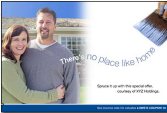
Residential tenant postcard - Front

Send your residential or commercial tenants a personalized card from you with a special Lowe's offer.